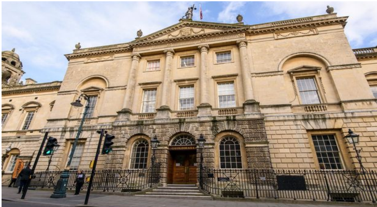
Bath Guildhall High St, Bath, BA1 5AW